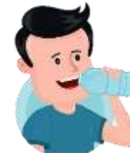
Drink plenty of water.