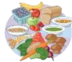
Eat fiber-rich food.