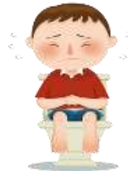
Restraining during bowel movements