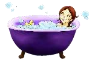
Sit in a warm bath several times a day for short periods of time

Consult with your physician before making any drastic lifestyle changes. He or she may refer you to another specialist for more advanced treatment.