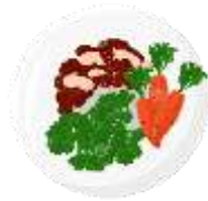
A low-fiber diet